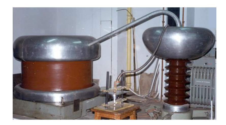
Fig. 3 A PB free 100 kV Transformer and 1.1 nF Coupling Capacitor setup in HV Laboratory at IIT Kanpur